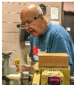
Candid photos of the workshop...