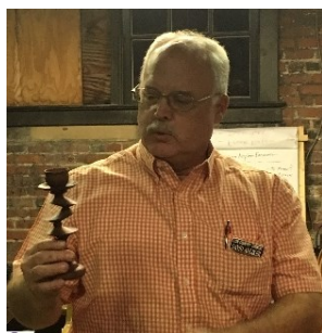
David Anliker—Offset candle stick