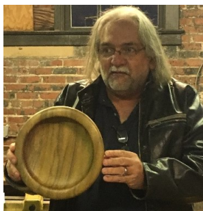
Al Medlock—small Ambrosia Maple platter