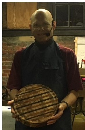
Frank Anson—round Segmented cutting board—Cherry, Maple, Walnut