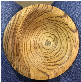
Sean Tabriz—Zebrawood ogee shaped bowl