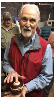
Roy Yarger—small segmented vessel from Purple Heart and Holly