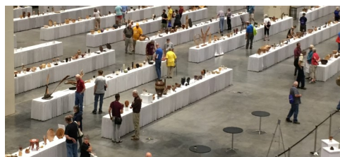
Instant Gallery was Huge!