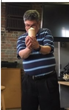
Jeffery Kumjian—small sycamore lidded box