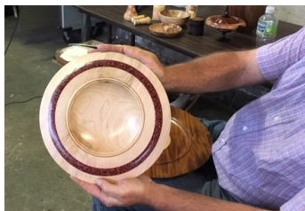
Noel Wright—maple platter with inlay on rim