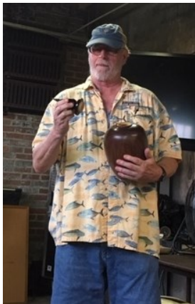
Ronny Burgsteiner—large walnut vessel, African Blackwood finial (made by Roy Yarger)