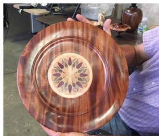
Noel Wright—large platter with wood inlay