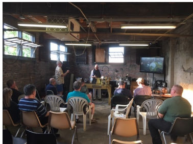
Members settling in for an informative demonstration.