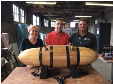
Civil War era keg torpedo