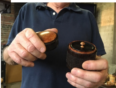
Dick Glover—small lidded box, inset madrone on top, East Indian rosewood, carved/stipples outside