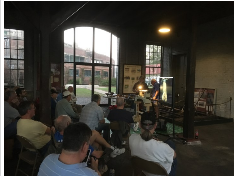
Several shots of the meeting at the historic Georgia Railroad Museum